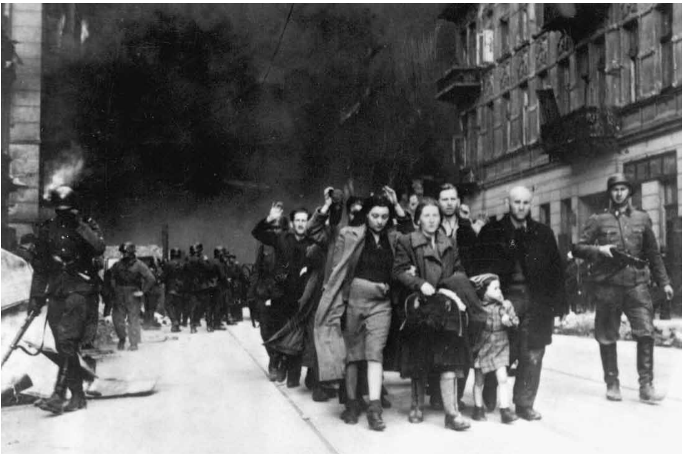
Jews arrested during the Uprising of the Warsaw Ghetto in April-May 1943

“The right of nations to self-determination implies exclusively the right to independence in the political sense, the right to free