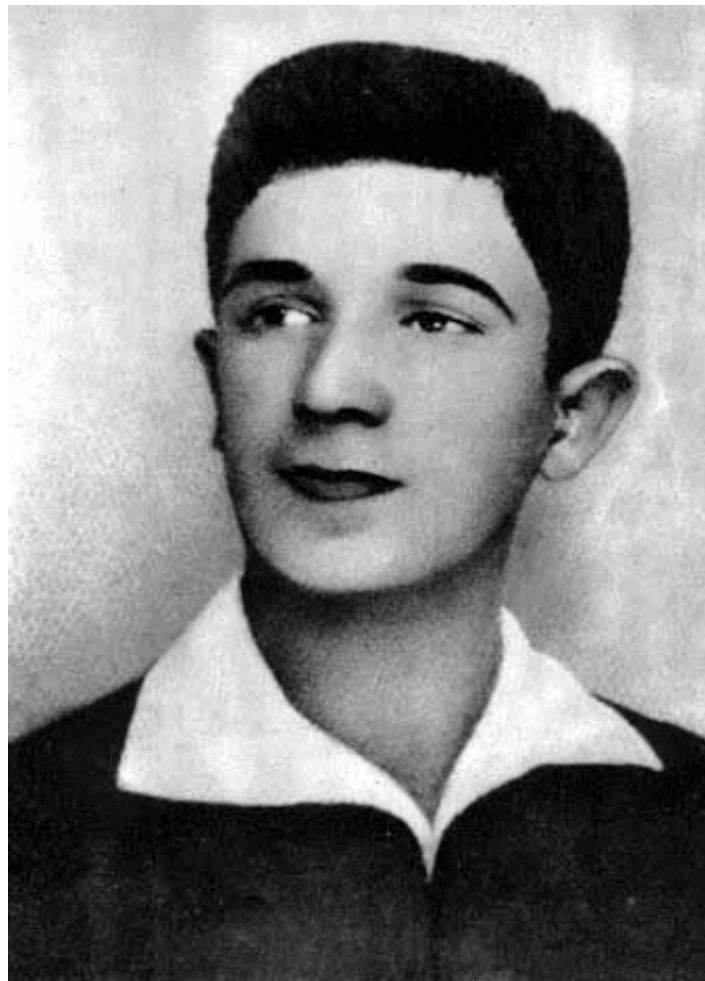
Mordechai Anielewicz (1919-1943), Commander of the Jewish Resistance Organization ZOB during the Warsaw Uprising in 1943

Lenin was very aware of the terrible oppression of the Jews, who were suffering from systematic discrimination, were subject to bloody pogroms, and forced to live in the Pales (a series of laws were established by the Monarchy determining where Jews could settle in the Empire, these regions later were called the Pale of Settlement. The Pale included all regions of former Poland, Ukraine and others.