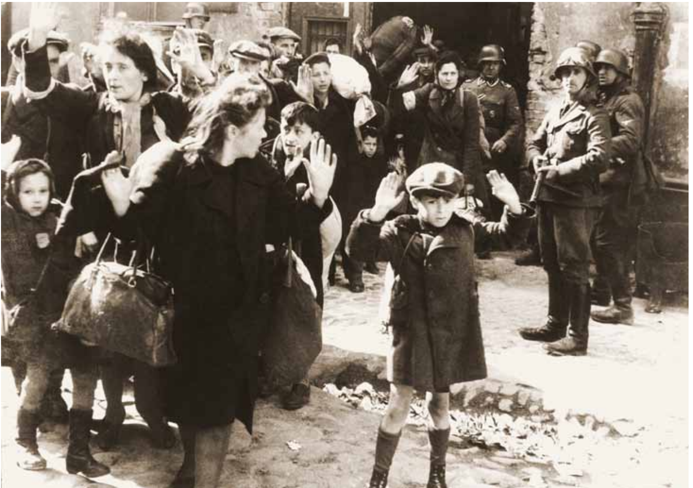
Jewish Women and Children arrested during the Uprising of the Warsaw Ghetto in April-May 1943

Scholars: physicians, lawyers, teachers, scribes, rabbis, judges,