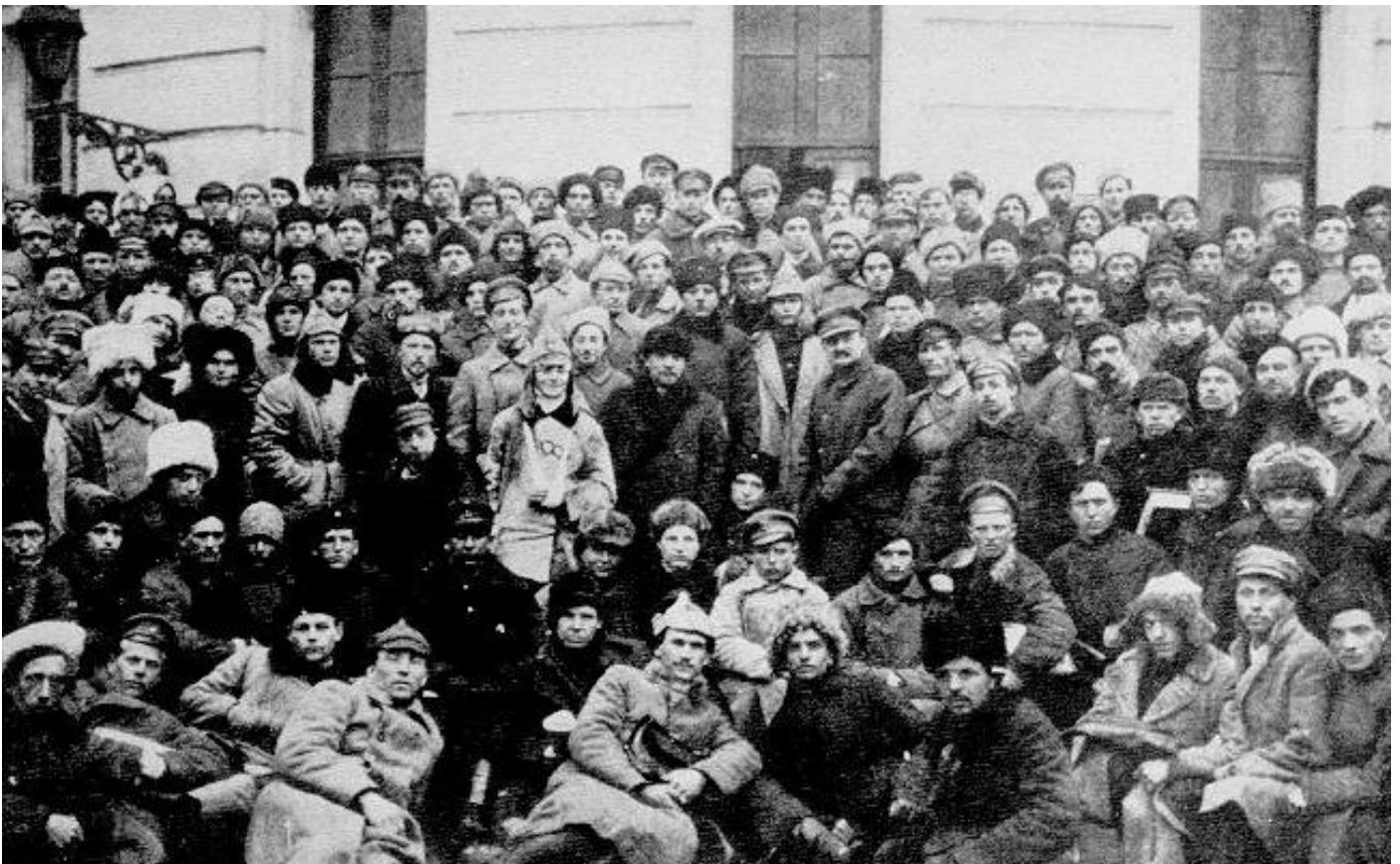
Lenin and Trotsky with soldiers of the Red Army in 1921

Fight with the RCIT to build a strong genuine Trotskyist International Organization! ■