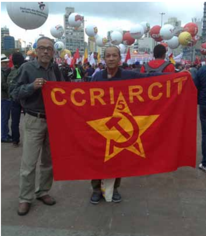
CCR Activists at a mass demonstration in Sao Paulo

12. The CCR is dedicated to building an authentic revolutionary organization to struggle for the rights of the workers and poor! Support the formation of the CCRI/RCIT as a revolutionary international organization! For a revolutionary 5 th international of the world working class (world party of socialist revolution)! ■