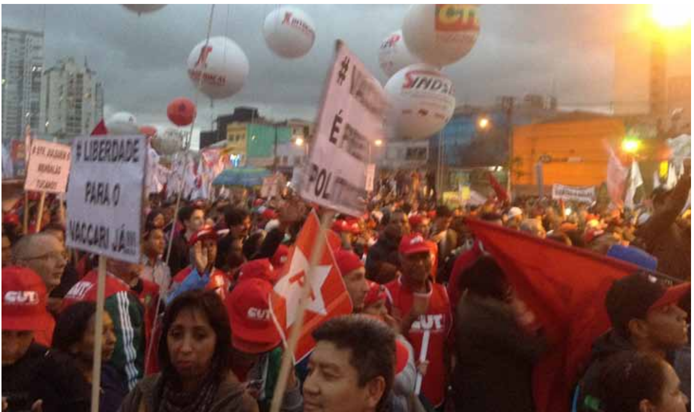
Mass demonstration of the trade union federation CUT in Sao Paulo

In the present crisis, we do not support the impeachment of Dilma, nor do we call for new elections as the right-wing PSDB has done. Similarly, we do not support the position of the PSTU which states that "it is not in favor of Dilma's exit at the hands of corrupt Congress," instead calling the social movement to break with the PT's policy to seek an alternative government. Yet, despite their alleged position, the PSTU is equivocating when it says