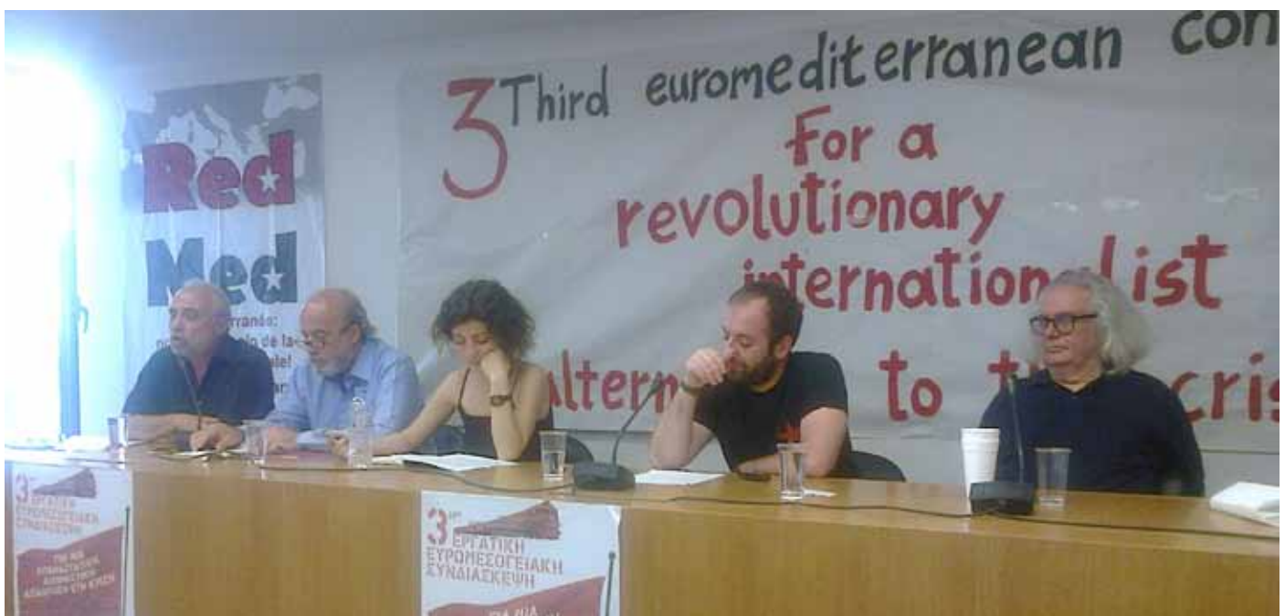
Third Euro-Mediterranean Conference, Athens, Greece, 18-20 July 2015

However, irrespective of these differences, we saw the conference as an important and useful event which brought together socialists from various countries in order to discuss perspectives and program for the coming class struggle. Such a place for constructive and serious discussions is very much needed in periods like the present one containing as it does so much potential for revolutionary developments together with the dangers of counter-revolution. ■