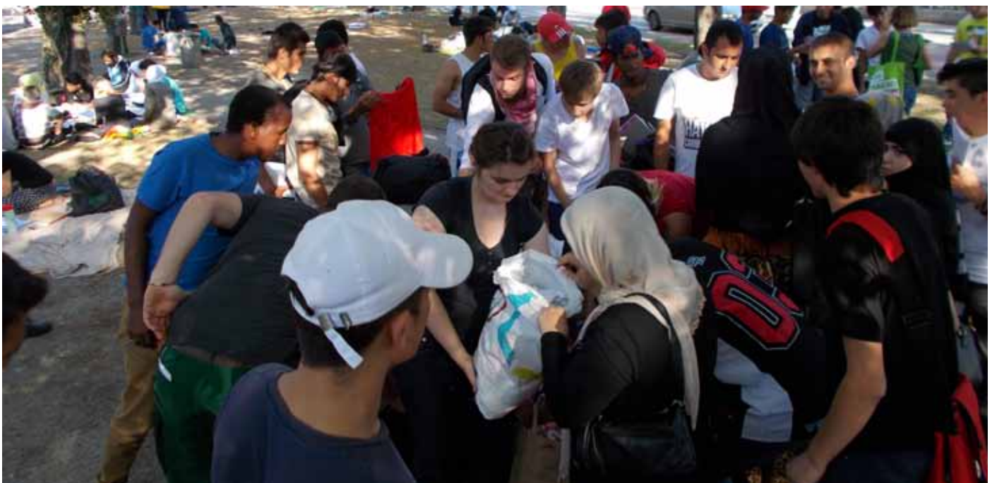
Comrades of the RCIT-Section in Austria bringing clothes to Refugees

See photos of a solidarity action of the Austrian section of the RCIT here: http://www.rkob.net/wien-wahl-2015/fluechtligen-helfen/ ■