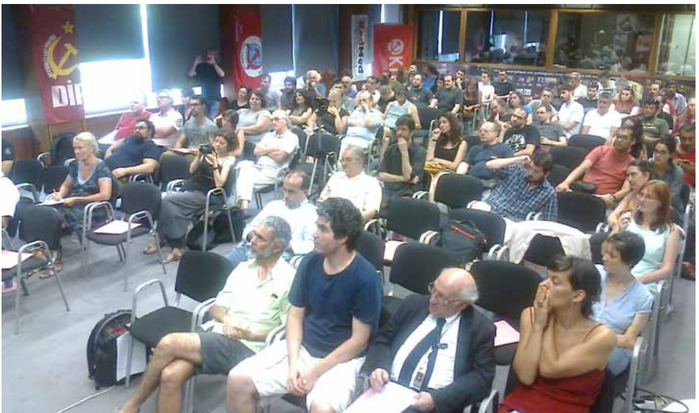
Third Euro-Mediterranean Conference, Athens, Greece, 18-20 July 2015