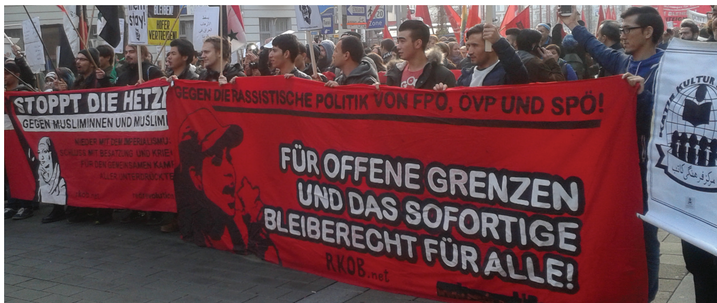
"No to Racism! For Open Borders" (Banner of the Austrian Section of the RCIT at a pro-refugee demonstration in Vienna on 26 November 2016)

"The First Minister has already said a new independence referendum is "highly likely" in order to protect Scotland's place in the EU. Speaking to the Sunday Herald, Sturgeon hailed