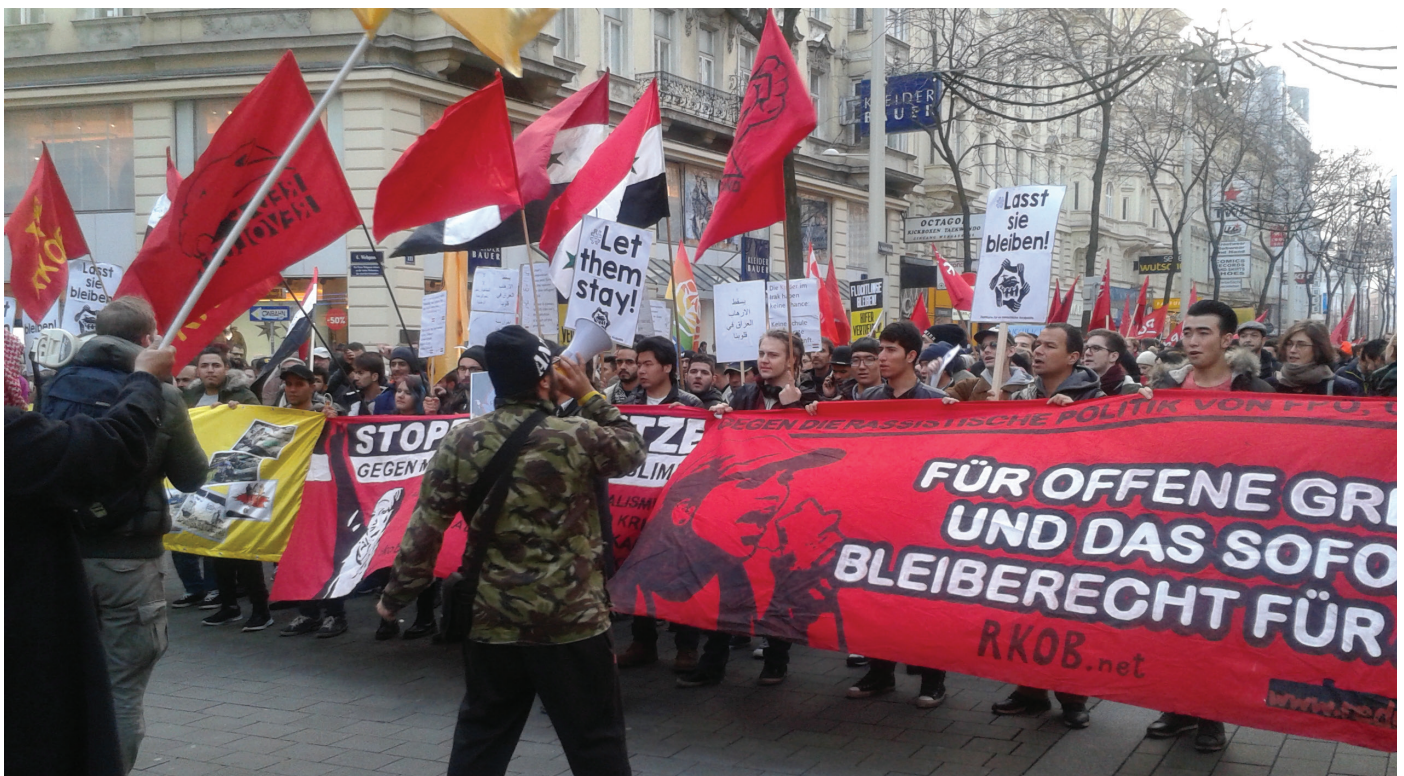
Contingent of the Austrian Section of the RCIT at a pro-refugee demonstration in Vienna on 26 November 2016

We also refer readers to the RCIT's latest World Perspective document: World Perspectives 2017: The Struggle against the Reactionary Offensive in the Era of Trumpism. Theses on the World Situation, the Perspectives for Class Struggle and the Tasks of Revolutionaries (adopted on 18 December 2016, https://www.thecommunists.net/theory/world-perspectives-2017/ )