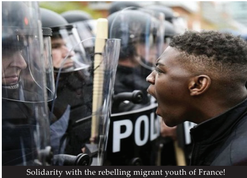
Solidarity with the rebelling migrant youth of France!

It is also important to spread the movement, as we already have seen in the demonstrations outside of the Banlieus and in solidarity movements in other cities and in the schools. However, it is crucial to extend the movement to the workers! A crucial link to this should be the Arab and black workers who suffer the same violence and who