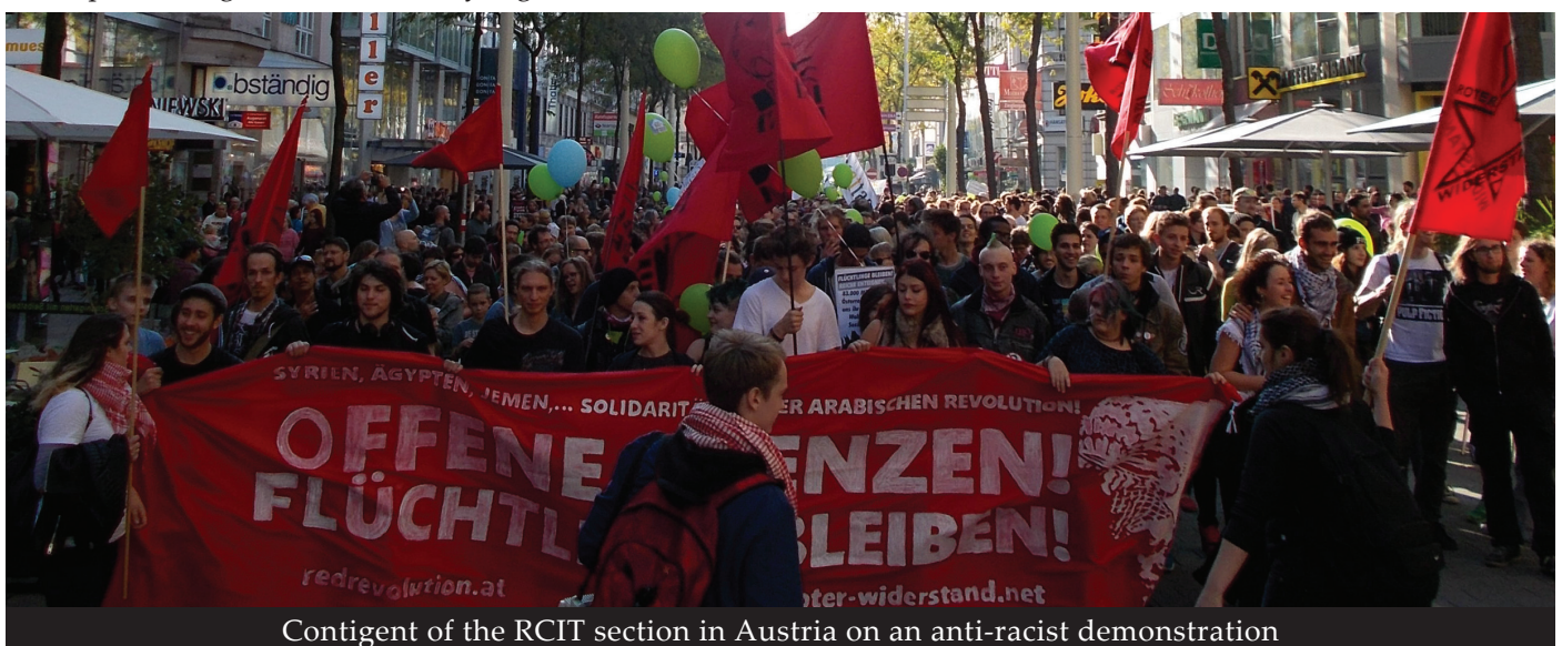
Contingent of the RCIT section in Austria on an anti-racist demonstration

We call on all progressive forces to show their solidarity with us by protesting against the right wing parliamentary inquiry and to reject any legal measures by the Austrian state against the Austrian section of the RCIT as well as against the Egyptian migrant organization.