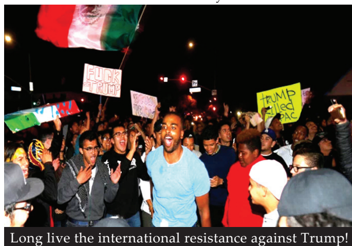
Long live the international resistance against Trump!

Likewise the Austrian comrades of the RCIT joined the march in Vienna as well as solidarity actions with the Arab