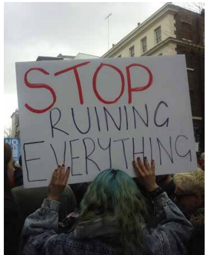
March in Defence of the NHS, London 4.3.2017