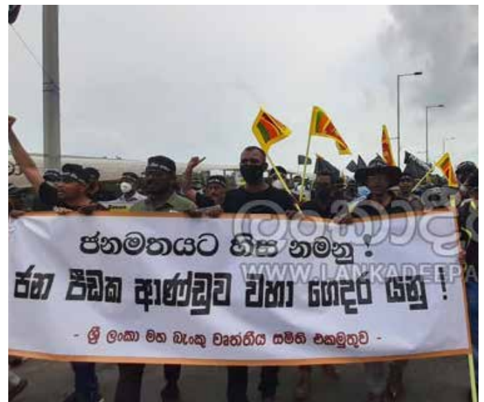
Anti-Government Demonstrators in Sri Lanka

Ceylon Independent Teachers' Service Union