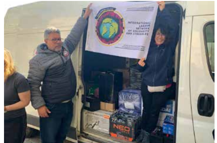
Impressions from our convoy bringing aid to the Ukraine (30.4.2022)