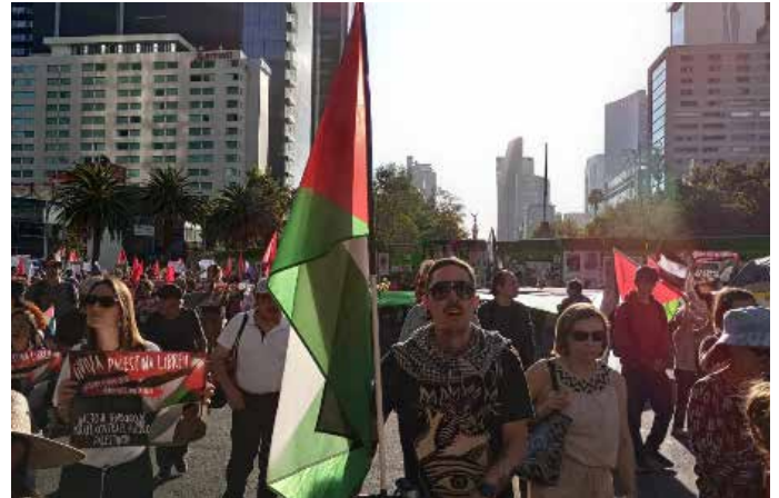
Demonstrators at the pro-Palestine march in Mexico City (28.10.2023)