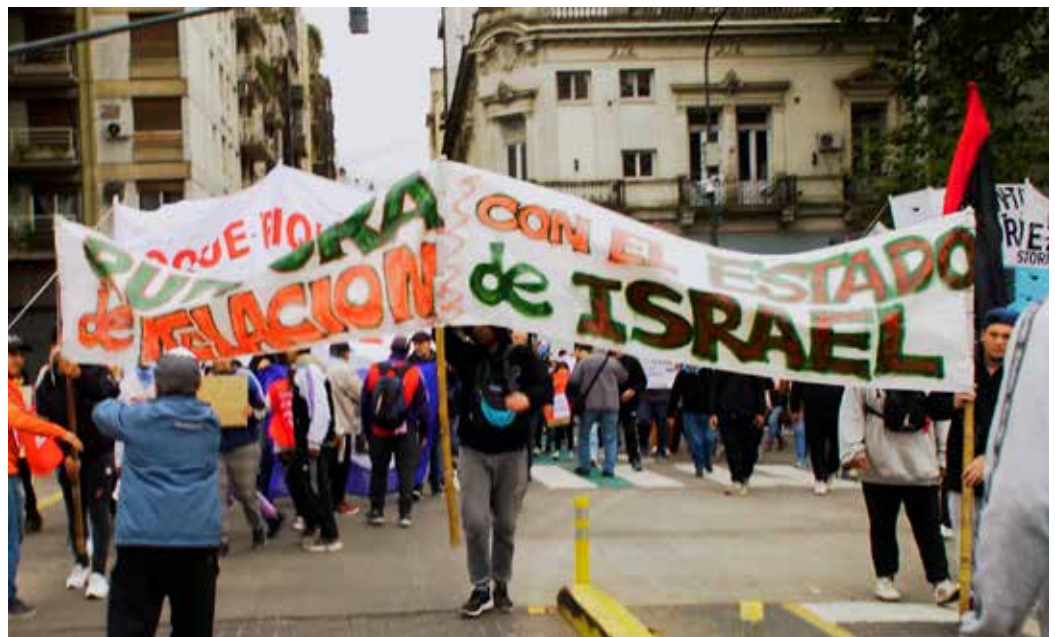
Joint Contingent of the Argentinean section of the RCIT and other organisation which call for the boycott of Israel at a pro-Palestine demonstration (Buenos Aires, 25.10.2023)

Convergencia Socialista , the Argentine section of the CCRI, participated together with a group of organizations, with which we have initiated a campaign to break relations with the colonialist State of Israel.