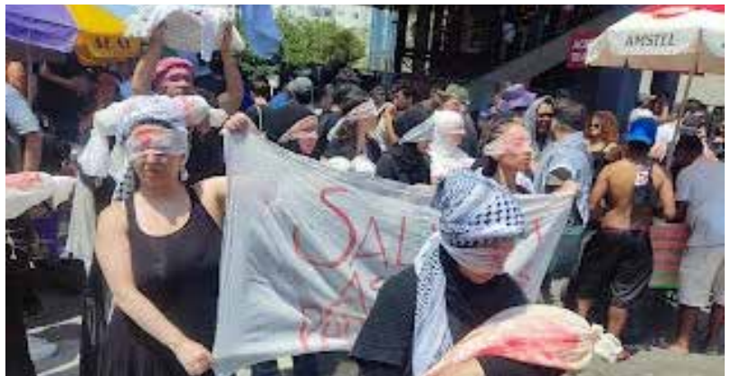
Demonstrators at the pro-Palestine march in Sao Paolo (12.11.2023)

The Brazilian section of CCRI/RCIT participated in the demonstration. We call for an immediately end to the genocide that is currently taking place in Gaza, for the defence of the resistance of the Palestinian people, that the Lula government immediately break Brazil's diplomatic relations with the Zionist Apartheid State of Israel For a free and democratic Palestine from the River to the Sea!