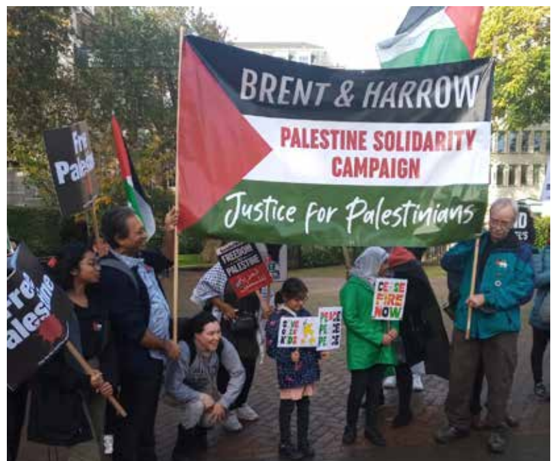
Demonstrators at the pro-Palestine march in London (28.10.2023)

Militants of the RCIT handed out many leaflets – in English and Arab language – calling for a stop of a new Nabka and support for the heroic Palestinian resistance. It was noticeable that there were no trade union banners on the march. The march ended at Downing Street where they were addressed by Labour MP's mostly of Muslim origin.