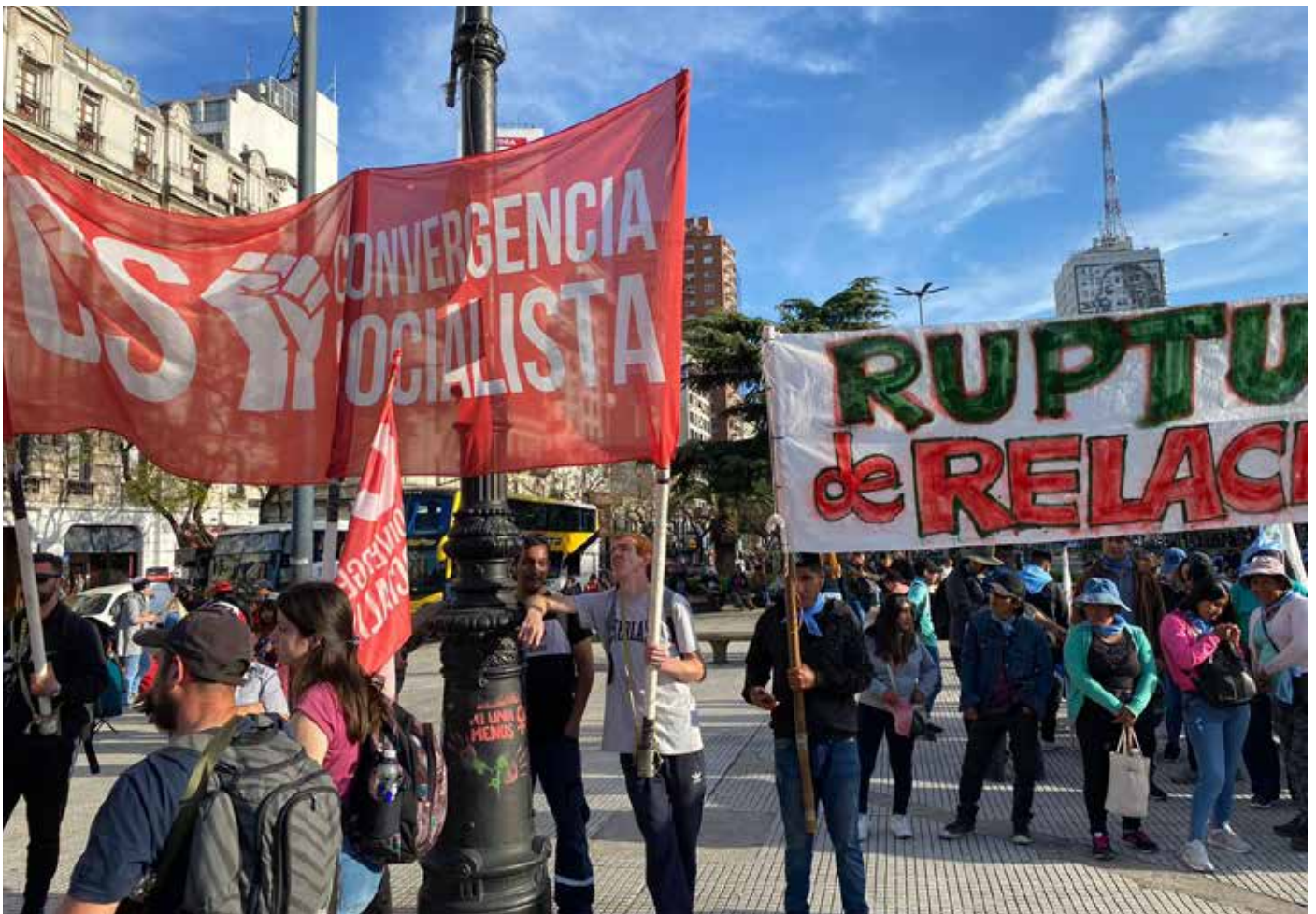
Joint Contingent of the Argentinean section of the RCIT and other organisation which call for the boycott of Israel at a pro-Palestine demonstration (Buenos Aires, 25.10.2023)

Convergencia Socialista (the Argentinean section of the CCRI) organized a joint contingent with other organizations, MTR, TORRE, People's Assemblies and PSTU, behind a common flag that demanded that the Argentine state break relations with Israel.