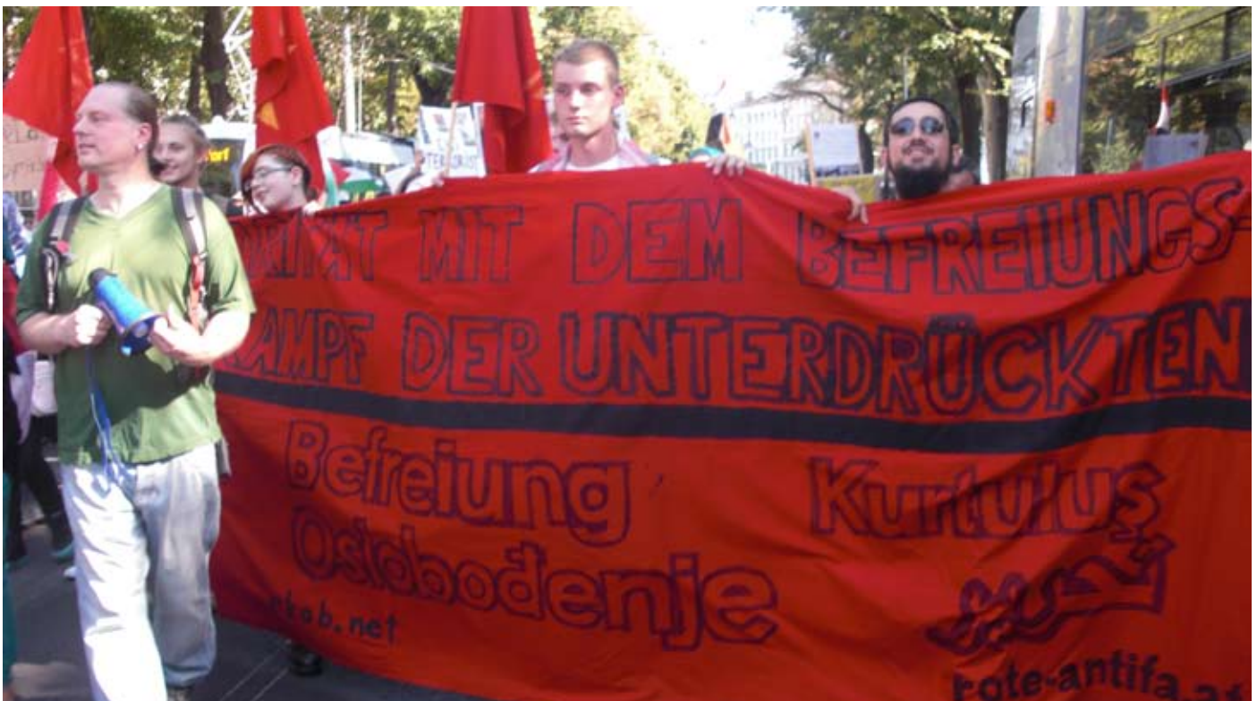
RKOB-Banner and activists at a Solidarity Demonstration with the Resistance against the Military Dictatorship in Egypt, 18.8.2013 (Vienna, Austria)