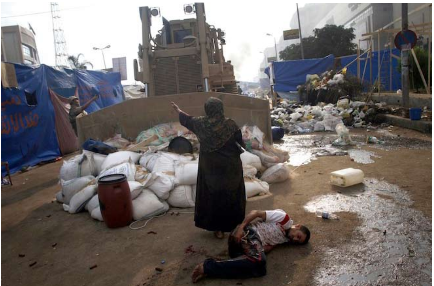
Heroic Egyptian woman tries to stop a military bulldozer from running over a wounded youth

After the massacre on 8 th July, when the army killed more than 50 pro-Morsi demonstrators who staged a sit-in in front of an army headquarter in Cairo, the IMT justified the army repression by calling the Muslim Brotherhood the “Vendee” , i.e. the most counter-revolutionary force against the Revolution. In a situation where the army command