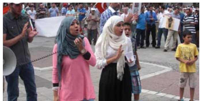
Young Women hold a Speech at a Rally in Austria, 23.8.2013