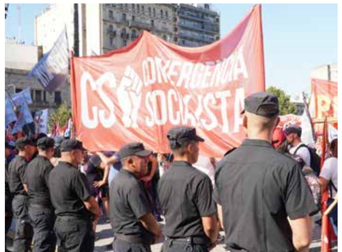
Comrades of Convergencia Socialista at the demonstration in Buenos Aires (01.02.2024)