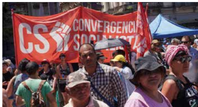
Comrades of Convergencia Socialista at the demonstration in Buenos Aires (24.01.2024)

Website of Convergencia Socialista (RCIT Section in Argentina): convergenciadecombate.blogspot.com