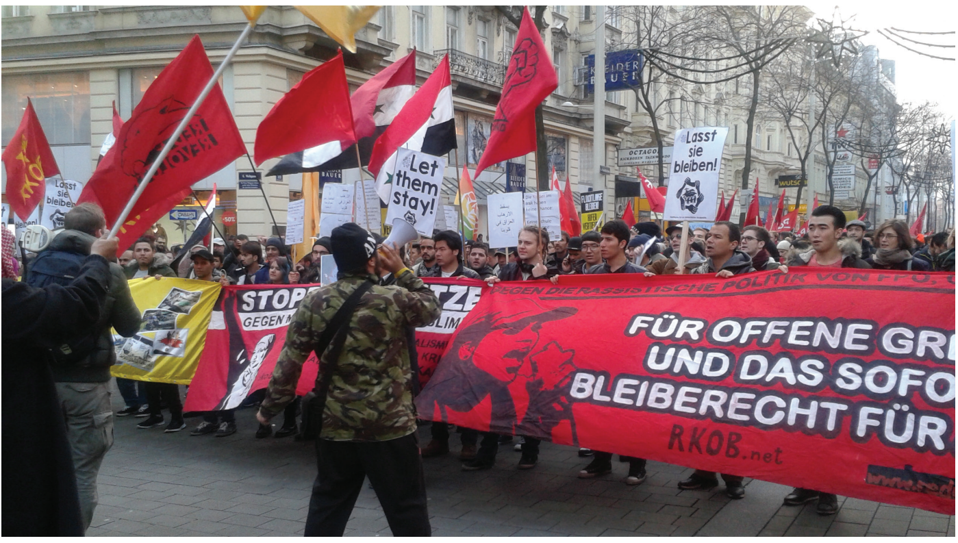
Contingent of the Austrian Section of the RCIT at a pro-refugee demonstration in Vienna on 26 November 2016

We also refer readers to the RCIT's latest World Perspective document: World Perspectives 2017: The Struggle against the Reactionary Offensive in the Era of Trumpism. Theses on the World Situation, the Perspectives for Class Struggle and the Tasks of Revolutionaries (adopted on 18 December 2016, https://www. thecommunists.net/theory/world-perspectives-2017/)