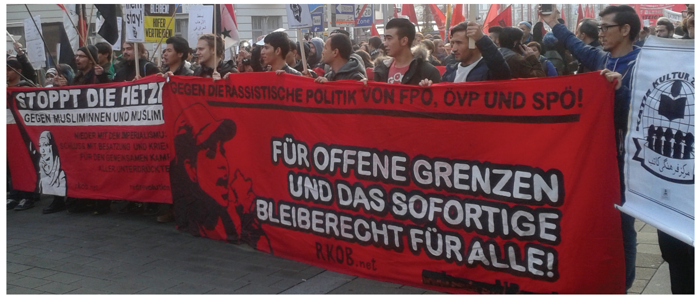
"No to Racism! For Open Borders" (Banner of the Austrian Section of the RCIT at a pro-refugee demonstration in Vienna on 26 November 2016

"The First Minister has already said a new independence referendum is "highly likely" in order to protect Scotland's place in the EU. Speaking to the Sunday Herald, Sturgeon hailed